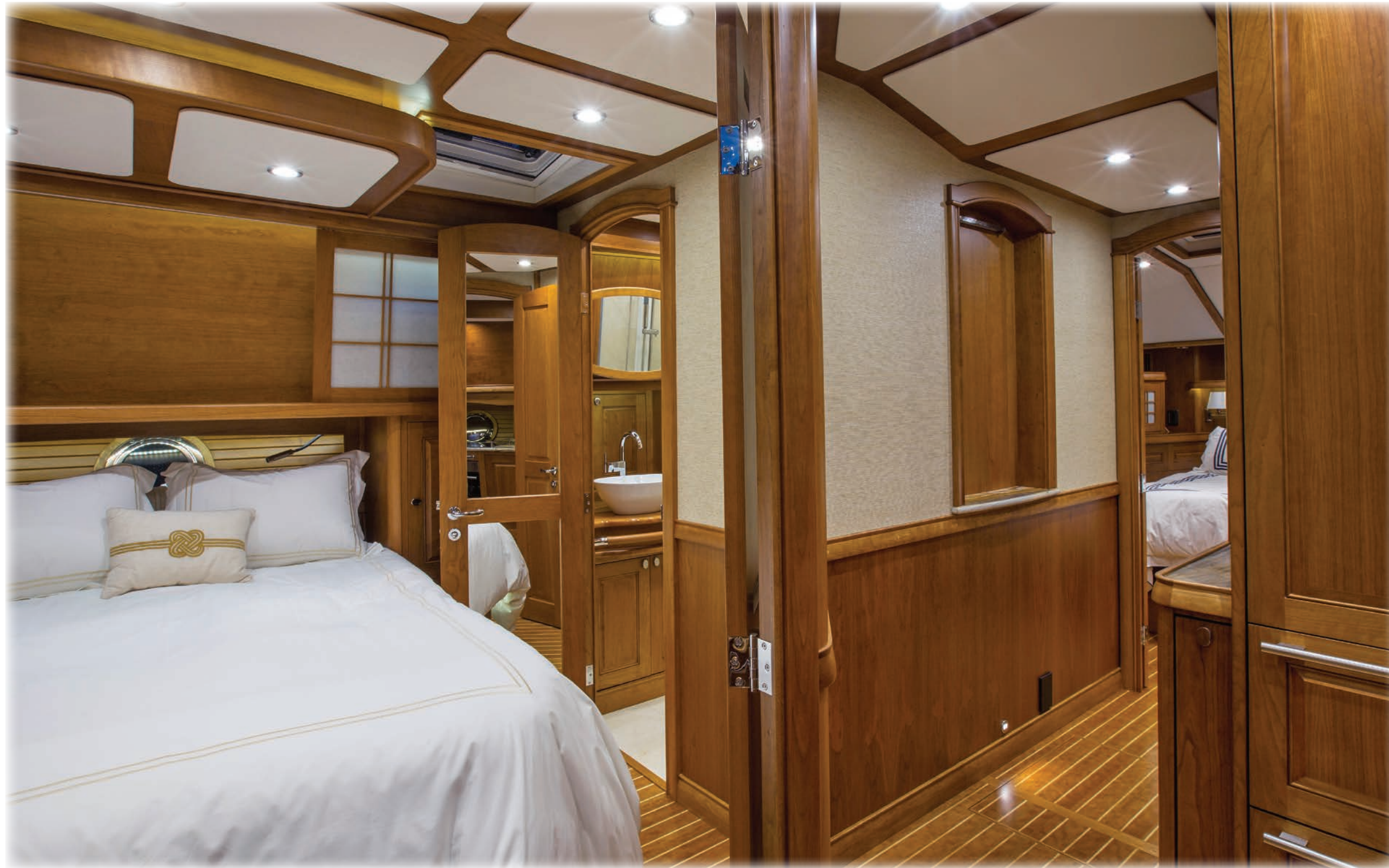
Your guests will enjoy the comfort of the spacious VIP stateroom and head.