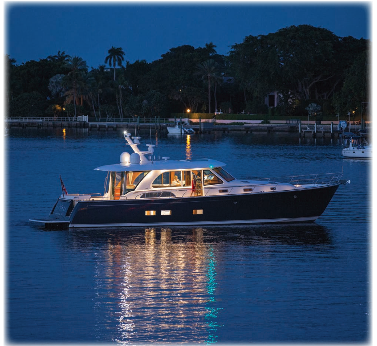
An evening cruise with family and friends