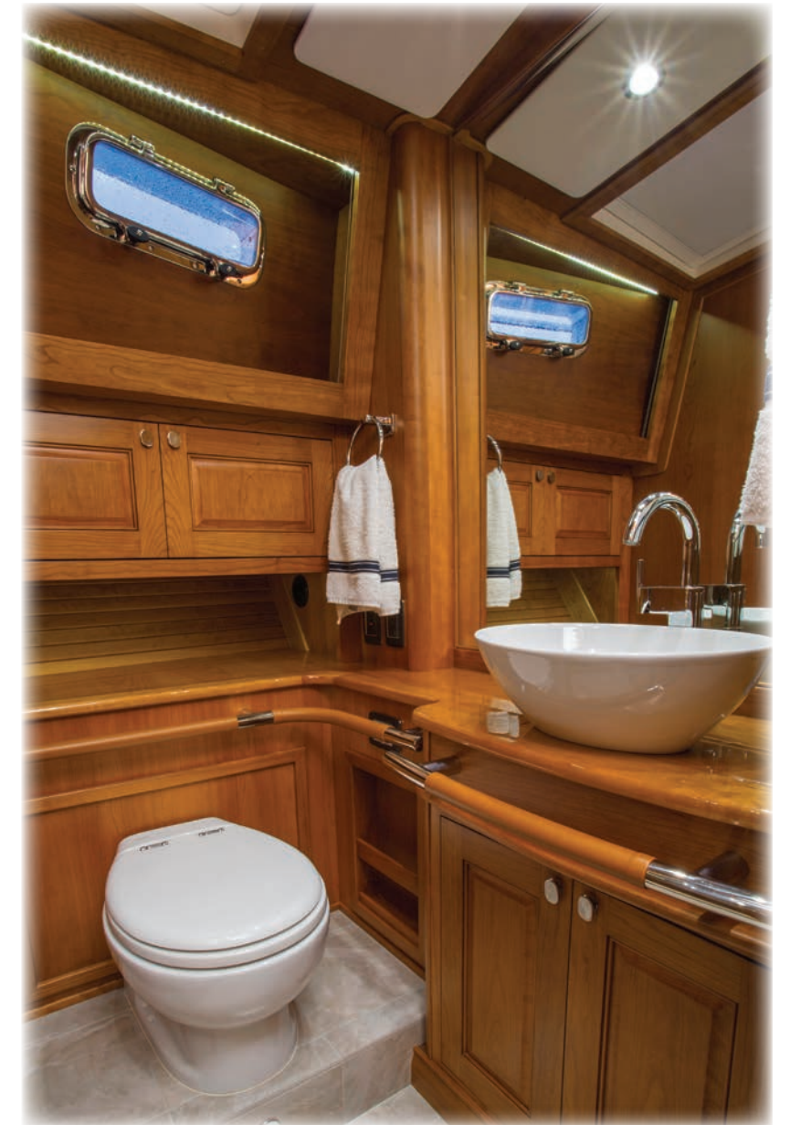
The guest head forward also serves as a day head. A separate shower is located to port