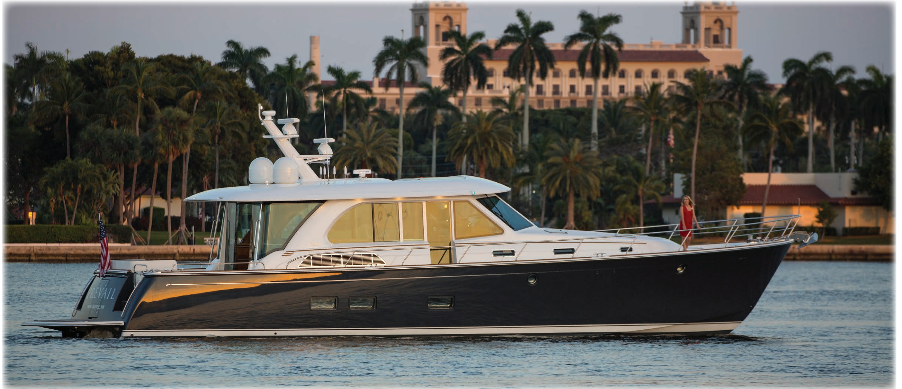
The Sabre 66 Dirigo. Stunning lines stand out in any harbor.