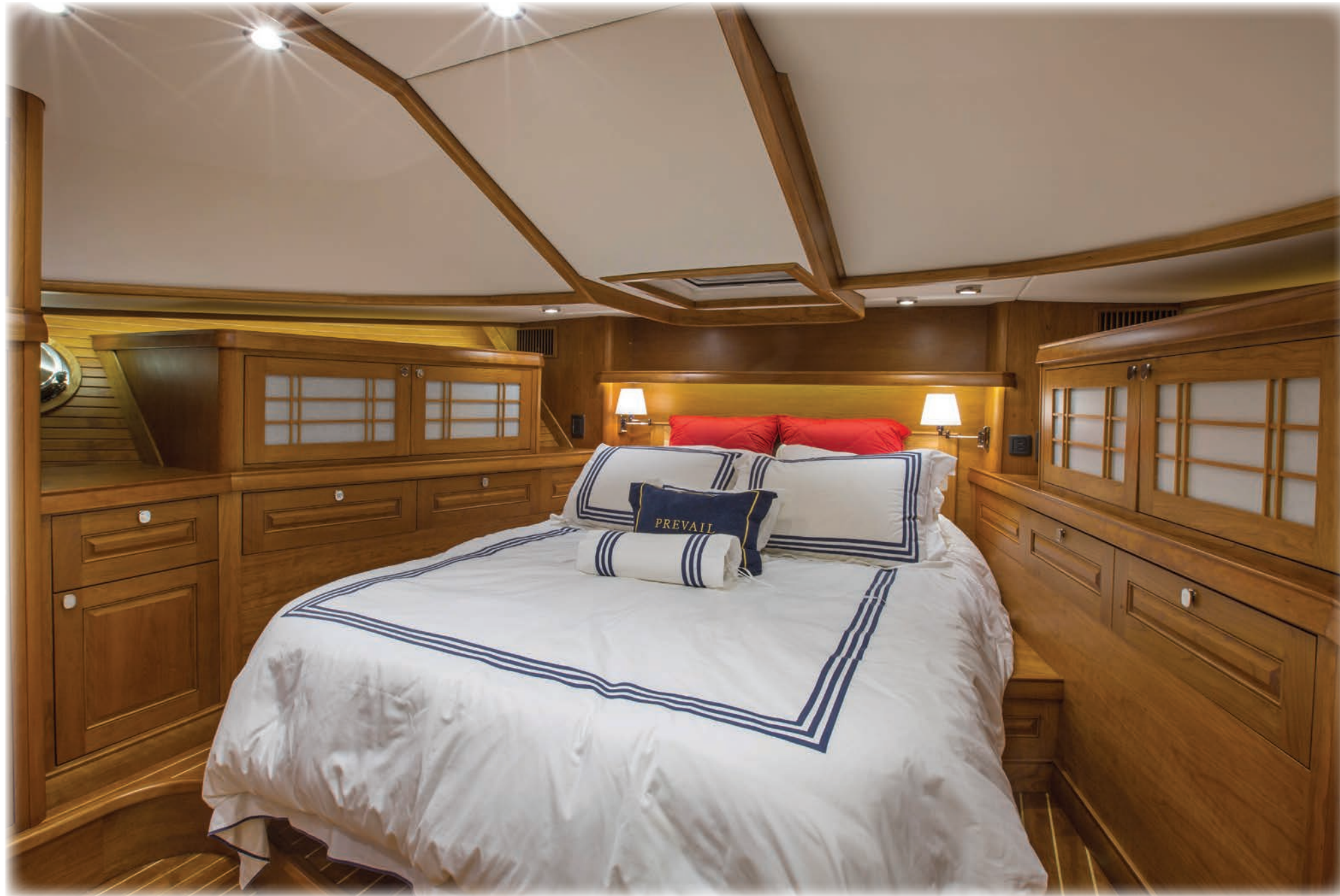
In the bow the queen-sized berth in the guest cabin can be split with the touch of a switch into two single berths. Elegant woodworking details abound