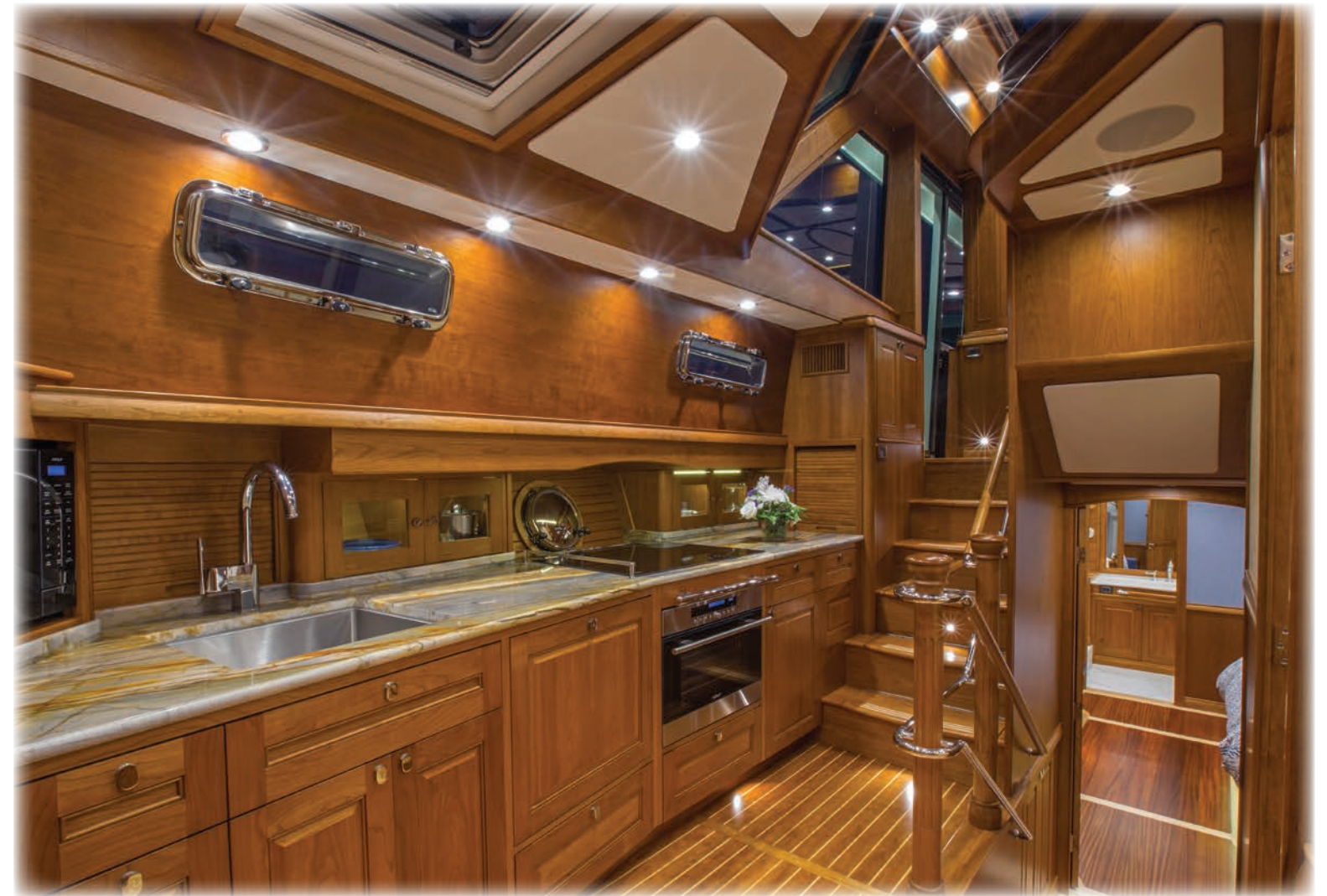
Her galley offers the best names in galley appliances for the preparation of gourmet meals aboard. Custom countertops are illuminated with natural light from above.