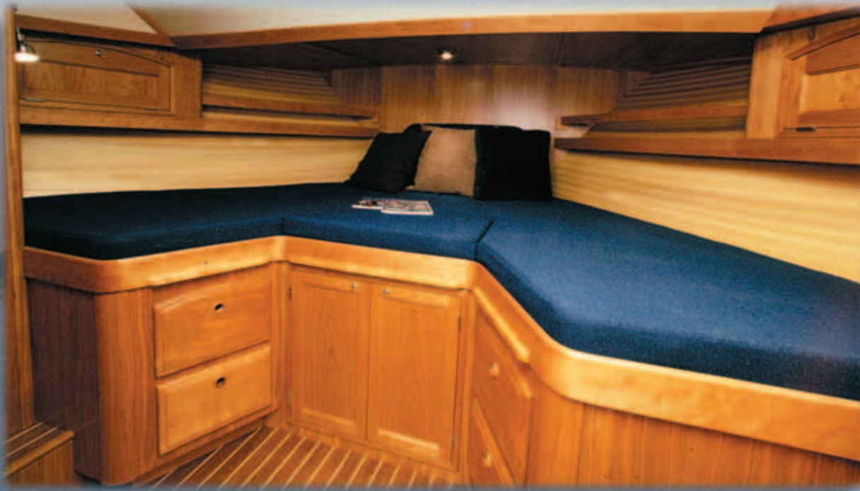
Forward cabin with vee-berth

Your guests will live in style and comfort aboard a Sabreline 47. The forward berth can be either a center island queen size berth or a very large vee-berth with filler cushion. Several lockers, two cedar lined hanging lockers and many deep drawers will provide space for your guest's belongings. And aft of the guest cabin and to starboard is another full head with separate shower stall. Ceramic tile flooring and Corian countertops provide the touches of luxury you have come to expect aboard a Sabreline motoryacht.