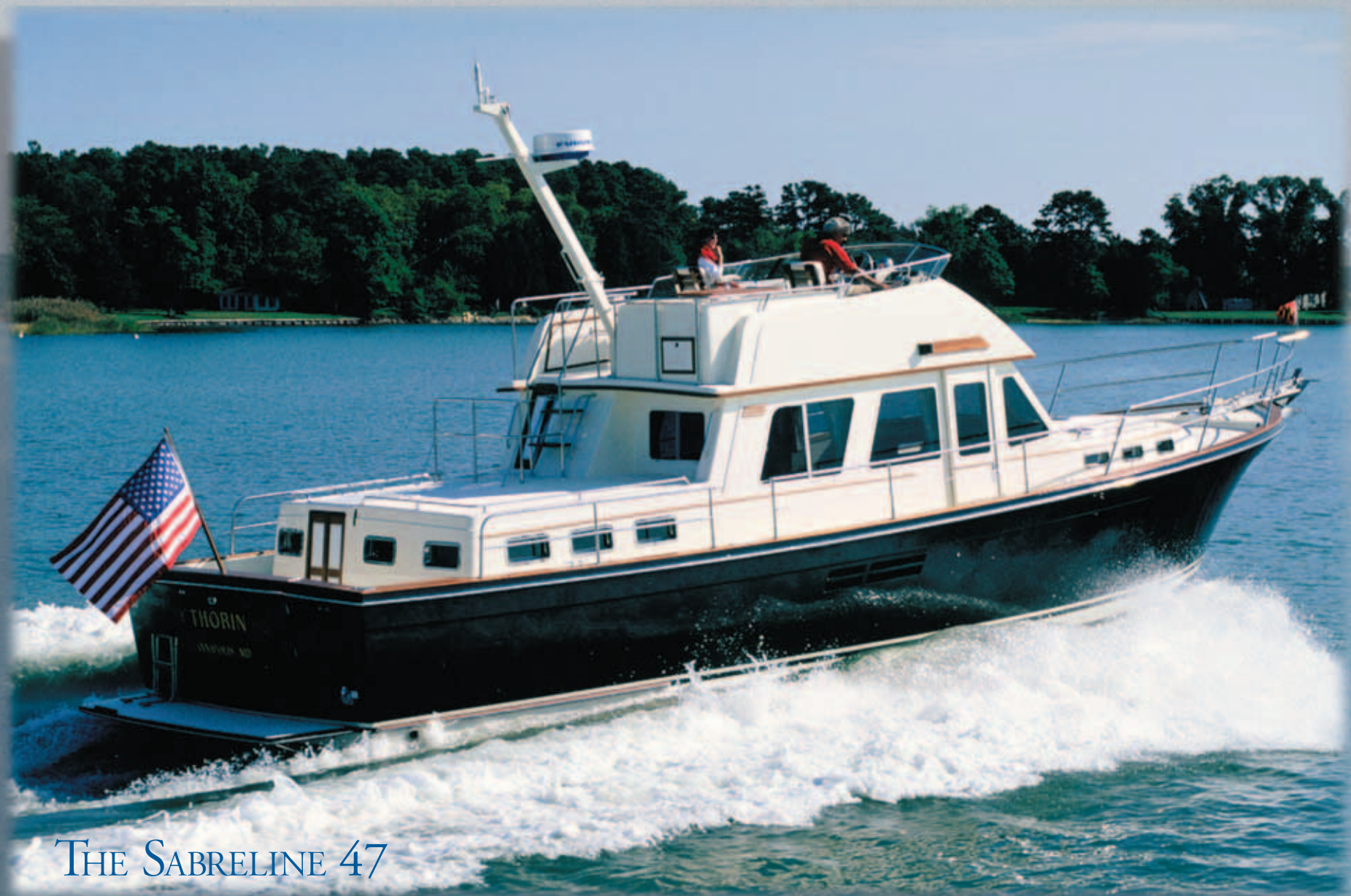
THE SABRELINE 47